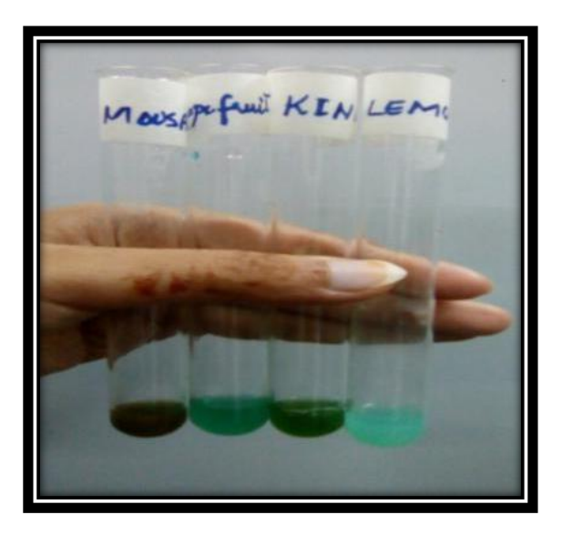
Fig. 2: Positive Benedict's test with citrus juices showing presence of reducing sugar in fresh juices except in tetra pack juice.

***Significance P<0.001, **significance P<0.01, significance P>0.05