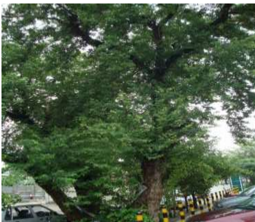
Figure 1: A mature Shisham ( Dalbergia sissoo ) tree used as explant source

However maximum number of growth of shoots (2.91) were seen in cocopeat. Least number of sprouting (2.81) with least number of shoots (0.39), and least number of leaves. (0.77) were observed in sawdust medium under laboratory conditions. Shoots developed from stem logs were thin and light green in color. Leaves were pale yellow to light green in color. Surprisingly, a very significant feature i.e., rooting was also showed by stem logs of shisham placed in cocopeat medium under laboratory conditions. Roots were developed from two logs placed in different trays filled with cocopeat.